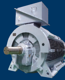
IC411 Sleeve bearing