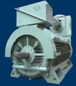
IC416 Antifriction bearing