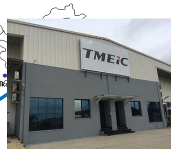
TMEiC PE factory in the State of Karnataka in Bangalore (currently operating)

TMEiC has invested approximately 5 billion yen as the first phase of establishing this motor factory and plans to further invest approximately 2.5 billion yen in fiscal 2016 for realizing sales on a scale of 10 billion yen in five years in fiscal 2020. Additionally, together with product development carried out in advance of the establishment of the motor factory for the TM21G series, which is globally competitive in terms of its compact size, light weight and high efficiency, the Indian factory will roll out a product lineup with a 150kW-23000kW capacity.