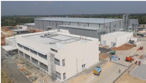
TMEiC motor factory in an industrial area in the State of Karnataka in Bangalore

Demand for industrial infrastructure development is rapidly growing in line with significant economic growth in India. In order to capture this demand and implement the “Make in India” initiative promoted by Prime Minister Narendra Modi, TMEiC has set up a manufacturing base in an industrial area on the outskirts of Bangalore to deliver industrial motors in India. While TMEiC has already established a power electronics (PE) factory, which is also located in the vicinity of Bangalore and is currently fully operating, the motor factory set up at this time has made it possible to deliver motor and drive products in the same way as in Japan in the Bangalore region.